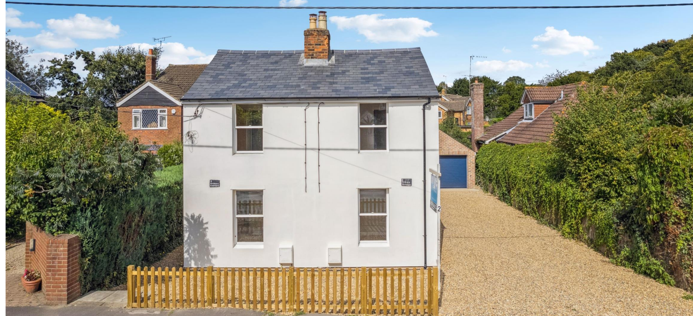
1, Arthur's Cottages, Stag Lane, Great Kingshill, Buckinghamshire, HP15 6EW